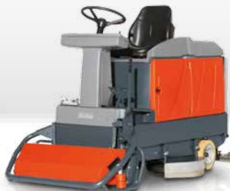
Scrubmaster B140 R with optional pre-sweep