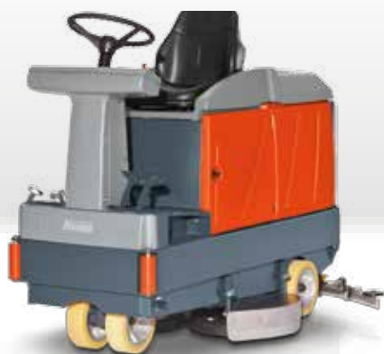
Scrubmaster B140 R