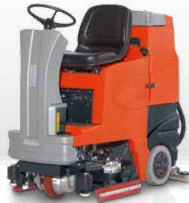
Scrubmaster B100 R Disc brush